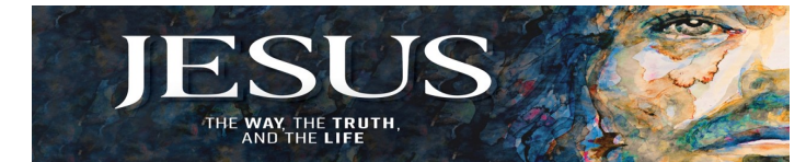
Jesus: The Way, the Truth, and the Life

Jesus is our savior, our redeemer, our Lord, and our God. Our belief in Jesus is what makes us who we are as Catholics, as Christians, but do we really know him as we should? Is Jesus a part of your life, or is he at the center of your life as he should be?