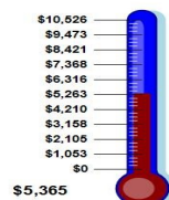
ST. PETER MISSION